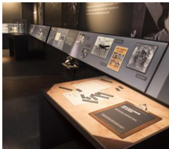
The Home Fronts Gallery