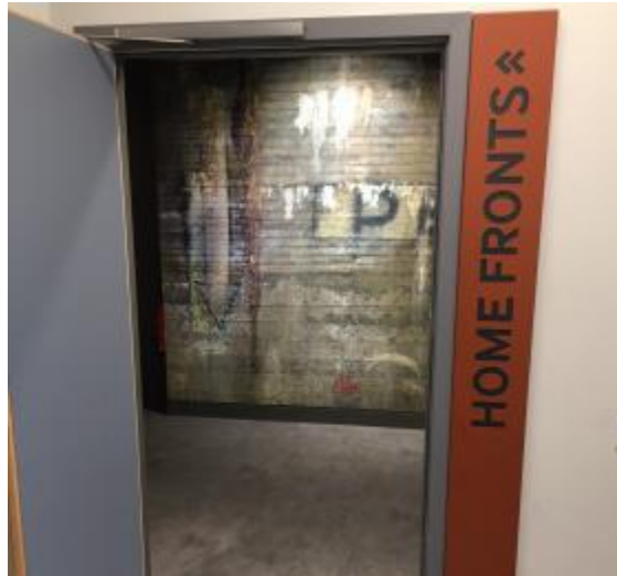
The entrance from the stairs and lift to the Home Fronts Gallery