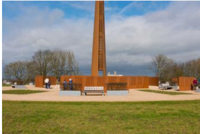
The Memorial Spire and Walls