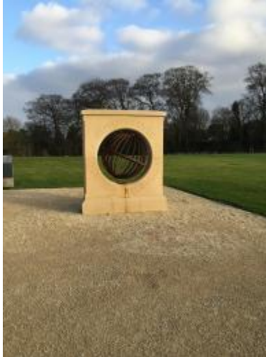
International Peace Garden entrance