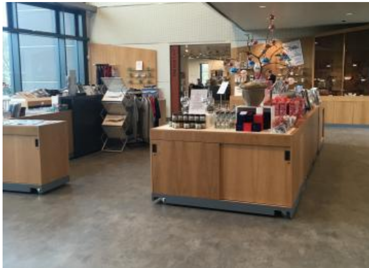
The Atrium Shop