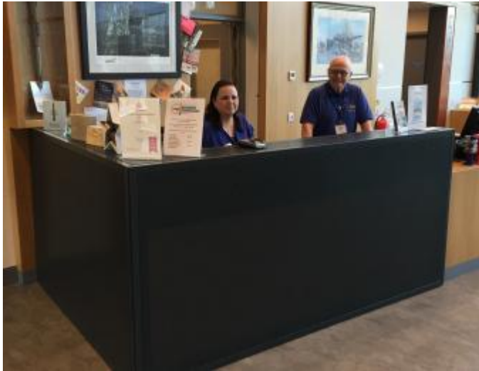
The Reception and Shop desk