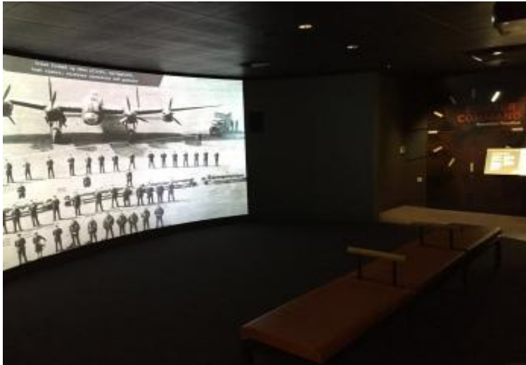
Introductory film in Operation Bomber Command Gallery