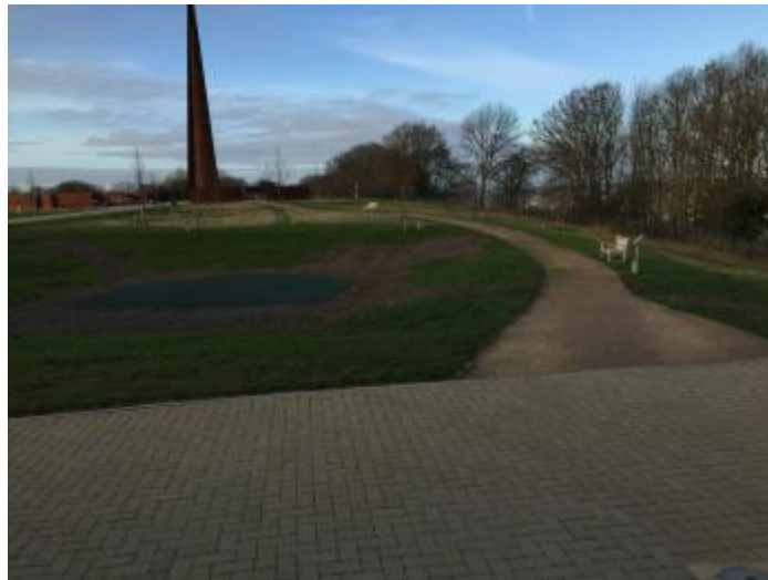
side path to the Memorial