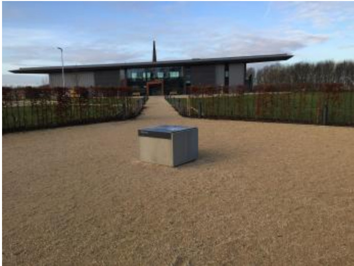
Access from the car park