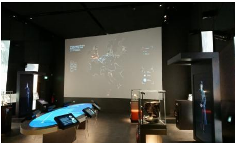
The darkest exhibition gallery is Operation Bomber Command