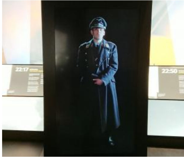
One of our Talking Head screens. There are three in this gallery