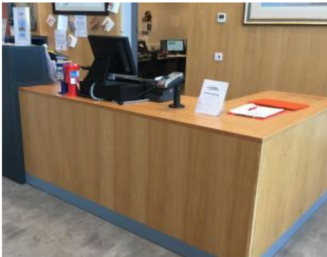
Accessible area of Reception and Shop counter