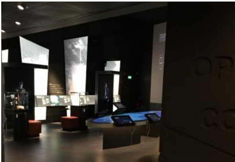
Entrance to Operation Bomber Command Gallery