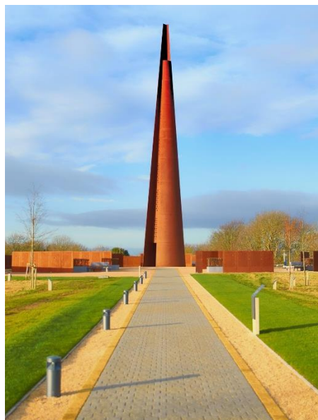
Path to the Spire