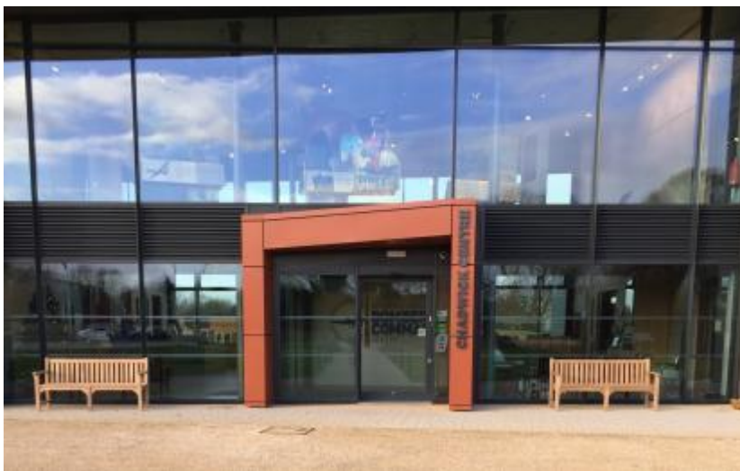
The entrance to the Chadwick Centre