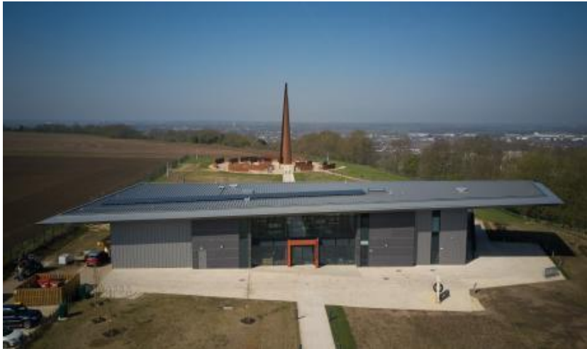
A view of the Chadwick Centre entrance and paths and drop off point