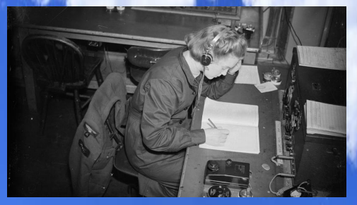
I use my headphones to listen for messages and signals.

Key Strengths Really good listening skills and patience