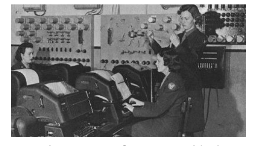
I work on a type of computer. This is a really cool machine because it sends and receives printed messages!

Key Strengths my writing and good attention to detail