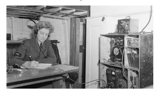
I listen for messages on a radio. This is top secret work and I can't tell any of my friends about it!

Key Strengths Intelligent, calm and really good hearing!