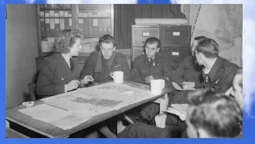
I help with secret operations. This is top secret work and I cannot tell you any more about it!