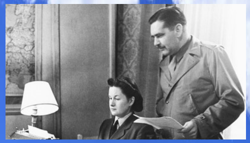
I help an R.A.F Dentist look after aircrews teeth. Don't forget to brush yours twice a day!

Key Strengths Caring, helpful and good at filling in forms