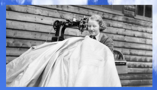
I am a wizard with a sewing machine! I fix Barrage Balloons