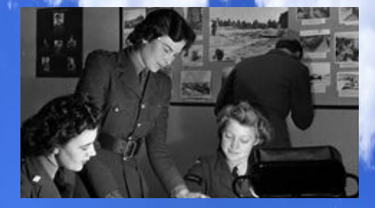
I make sure all the records are accurate and up to date.

Key Strengths Accuracy and I like to fill in every box