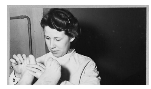
I help look after airmen and women who are poorly

Key Strengths Caring, sensible and practical