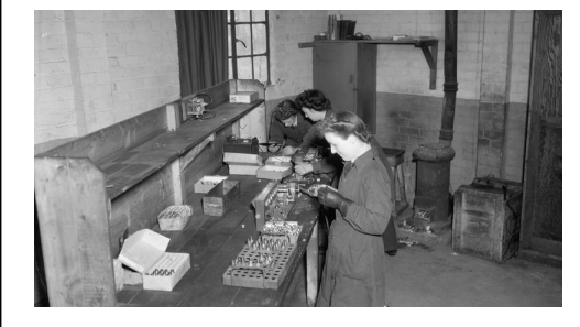
Test spark plugs, a really important part on an aircraft

Key Strengths Mechanically minded and practical