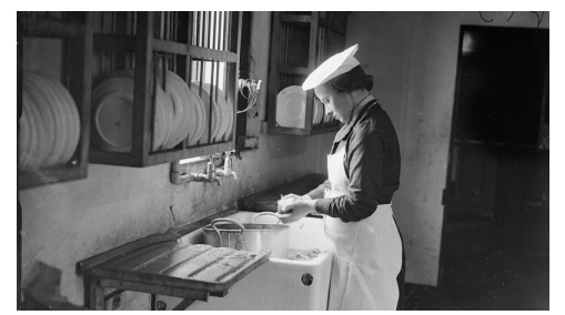
I help everyone really. I do housework, can be an orderly (help move things around the base) and I even help the cook!

Key Strengths Flexibility and practicality